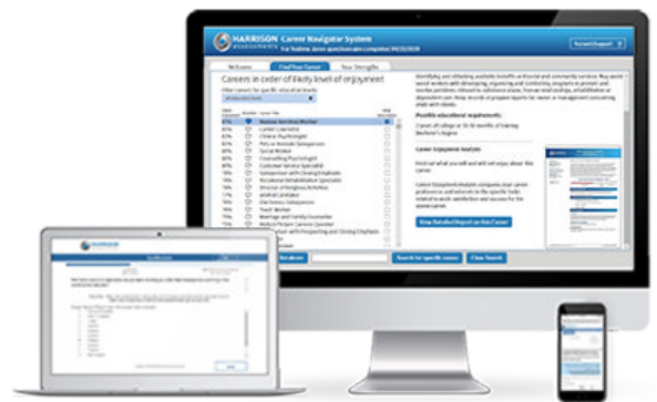
Online Interactive Career Portal